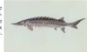
U.S. Fish & Wildlife Service

Atlantic Sturgeon are another ancient denizen of the Delaware Estuary. A live-tank features juvenile sturgeon year-round.