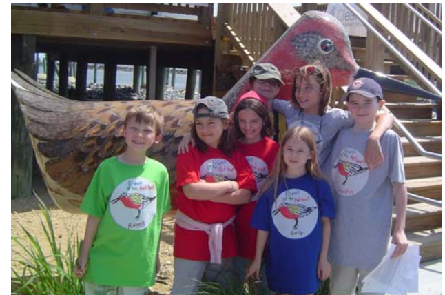
On Wednesday, May 23, 2007 Friends of the Red Knot Club attended the Grand Opening of the new DuPont Nature Center. Their picture was taken with "ALX" the center's Mascot.